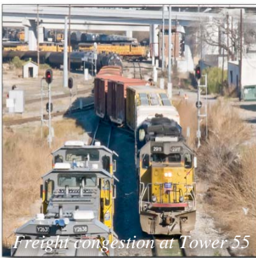
Freight congestion at Tower 55

Tower 55: What to do about the nation's most congested rail intersection? – The most congested freight rail intersection in the country is located at the northern edge of our district, and proposals to alleviate congestion could have a dramatic impact on the Near Southside. Preliminary alternatives include an east-west "flyover" railroad bridge that is at least 50 ft. tall and might require the demolition of buildings on the north side of W. Vickery Blvd.; or a north-south, 2-mile trench that could require a new tunnel for Vickery beginning at S. Main and traveling east under I-35W. The North Central Texas Council of Governments (NCTCOG) is leading a study of short and long-term alternatives; public meetings should begin in February. There are no easy or cheap solutions, and involvement from Near Southside stakeholders is important. Stay tuned for meeting notices, and check www.nctcog.org for the latest information.