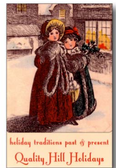
holiday traditions past & present Quality Hill Holidays

Historic Fort Worth, Inc. Presents Quality Hill Holidays – Imagine it is winter in the early 1900s. You are invited to two holiday parties, so you take a horse-drawn carriage to A Cattle Baron's Christmas (Thistle Hill, 1509 Pennsylvania Ave.) and then back in your carriage to the next gala, Hanukkah: Yesterday & Today (Mitchell-Schooner House, 600 8 th Ave.). Visit Ole Saint Nick, enjoy dreidel games, musicians, choirs, storytellers, traditional refreshments and more on Sunday, December 14 th , 2:00 till 10:00 pm. Adults $15, children 6-12 $7, cherubs 5 and under free, Press Pass 50% discount on 2 adult tickets. Bring your cameras – this is an event you don't want to miss. For more information visit www.historicfortworth.org .