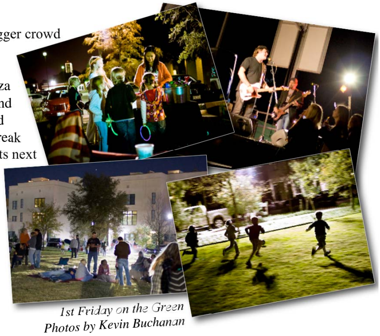
1st Friday on the Green

Lili's Bistro New Dinner Menu, 1310 W. Magnolia – New wine flights and nightly specials such as Onion-Crusted Tilapia, Poached Sea Bass, and Rack of Lamb. New dinner menu now offers popular items from Lili's lunch menu. Large plates start at $11, with grill items and small plates ranging from $8 to $12. Visit www.lilibistro.com or call 817-877-0700.