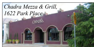
Chadra Mezza & Grill, 1622 Park Place