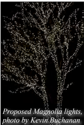
Proposed Magnolia lights