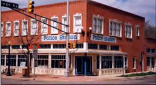
Additional officers on the street, thanks to FWSI members!

FWSI Membership Makes a Difference! Expanded Security Coming Soon – Dues from our 314 members support numerous initiatives to improve and maintain the quality of life on the Near Southside. This year, for the first time ever, the generous support from our members allows us to hire Fort Worth police officers for additional neighborhood patrols throughout the district. These supplemental patrols – on bike, foot, and in squad cars – will increase security presence and further deter criminal activity. FWSI thanks our neighborhood officers for their effective work in improving security. After more than a decade of dedication from those officers and Near Southside leaders, the district's crime statistics are now similar to Downtown's. Our work isn't done yet though, as perceptions still lag behind the reality of those promising statistics. Fortunately, the generosity of our members will allow us to enhance those security efforts, so thanks again! And please help us spread the word about Fort Worth South to potential members!