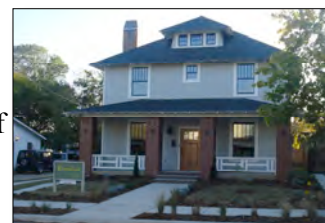
Breakfast: 1317 College Avenue