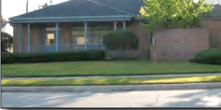
Typical development along Oleander Walk before the new code...

Near Southside Urban Design District's First Year – It's been a year since the new Near Southside Standards and Guidelines took effect, and the largest rezoning in the city's history is having a significant impact. The form-based code is promoting projects that