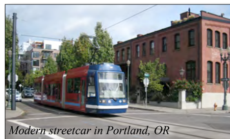
Modern streetcar in Portland, OR

Modern Streetcar Proposal Well Received by City Council – The City Council reacted enthusiastically to recommendations from the Modern Streetcar Study Committee at their briefing on December 16. Next steps include the hiring of a consultant team to refine the plans and begin preliminary engineering. The study committee also recommended forming a private, non-profit oversight group. The recommended starter system includes a north-south loop in Downtown, a line to the Cultural District, and a Near Southside line, running primarily along S. Main St. and W. Magnolia Ave.