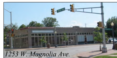
1253 W. Magnolia Ave.

New Business: Snelling Staffing Services, 1253 W. Magnolia Ave. – The vacant space in the historic storefront building at Magnolia and 5th Ave. will soon be filled by Snelling Staffing Services. Snelling will join fellow tenants and FWSI members JJ Robb Real Estate, PHPR, Inc., and Ames Fender Architects.