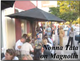
Nonna Tata on Magnolia