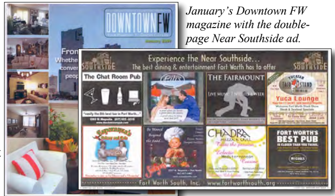
January's Downtown FW magazine with the double- page Near Southside ad.