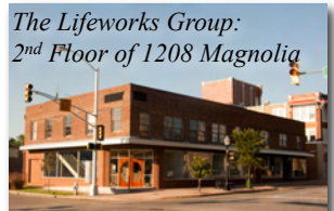
New Magnolia activity east of Hemphill.