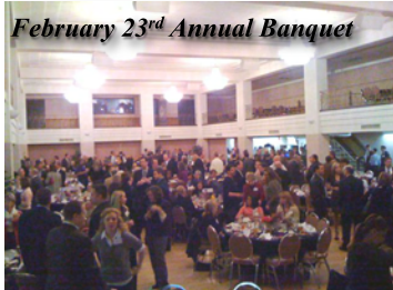
February 23 rd Annual Banquet