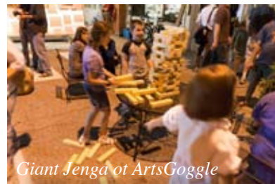
Giant Jenga at ArtsGoggle

Weekend to Remember – We're not sure of the best description to use.....Tipping point? Watershed moment? All we know is last weekend was something special! Here at FWSI we often think about that hypothetical moment in the future