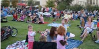
Families and friends at First Friday