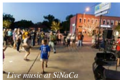
Live music at SiNaCa