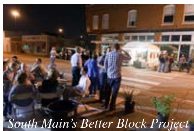
South Main's Better Block Project

biggest street party this area's ever seen, with thousands of visitors enjoying another beautiful night strolling the streets, chatting with old neighbors, meeting new friends, and checking out the art in the 65 participating venues. Perhaps the