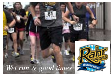
Wet run & good times