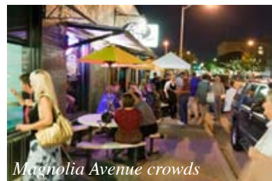
Magnolia Avenue crowds

ArtsGoggle Limited-Edition T-Shirts – Still available, very nice all cotton T featuring the signature goggles logo for only $15! Email michel@fortworthsouth.org , call 817-923-14343, or stop by 1606 Mistletoe Blvd. Sizes S-XXL.