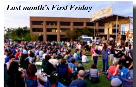
Last month's First Friday